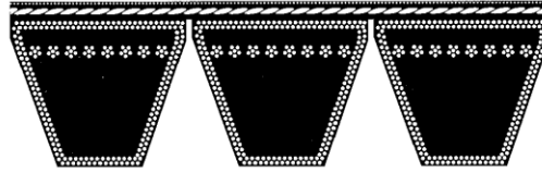
5V &amp; 8V CROSS SECTION VIEW